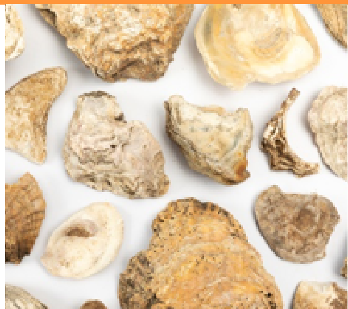
Rock Oyster and other shell fragments (undated)