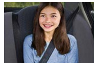
145cm or taller Suggested minimum height to use adult lap-sash seatbelt