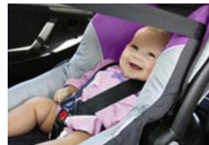
Up to 6 months Approved rear-facing child car seat