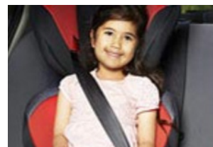
4+ years Approved forward-facing child car seat or booster seat